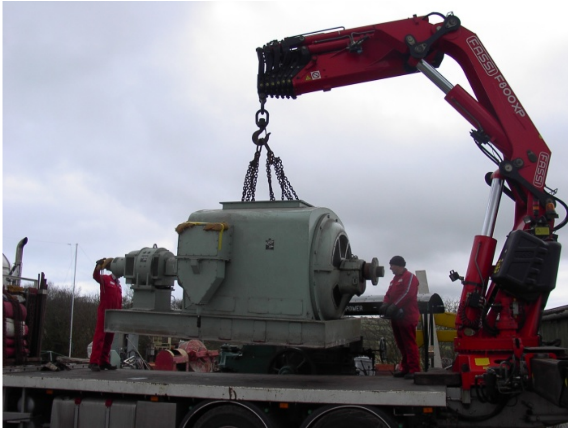
Transferring the alternator at the museum

Internal Fire Museum of Power, Cardigan Transport of 3Mw alternator and switchgear plus fire suppression system for Rolls Royce Bristol Proteus gas turbine £1,250