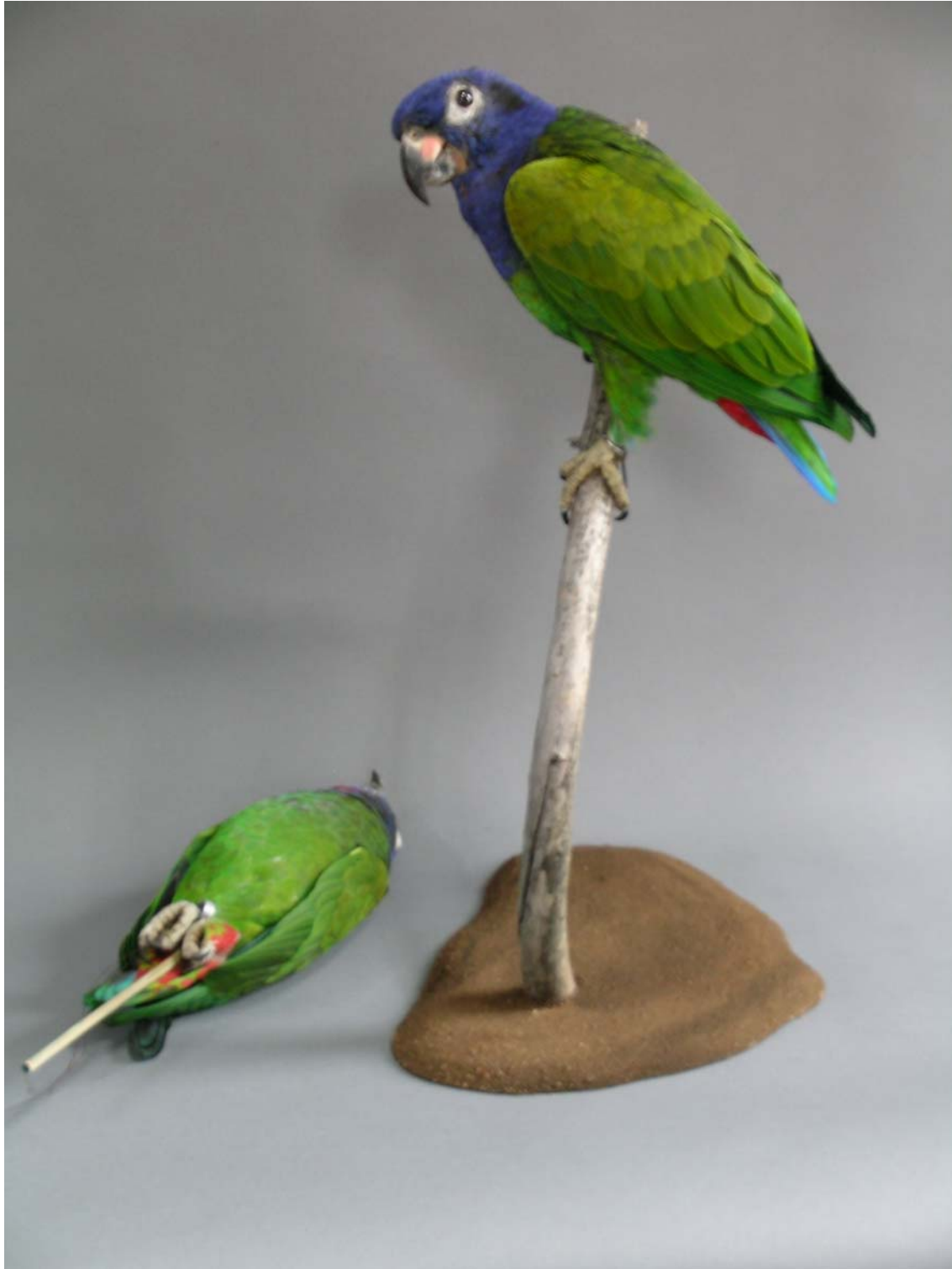
A mount and study skin of Blue headed parrot Pionus menstruus , one of the specimens transferred to Leeds Museum, following seizure by HM Customs