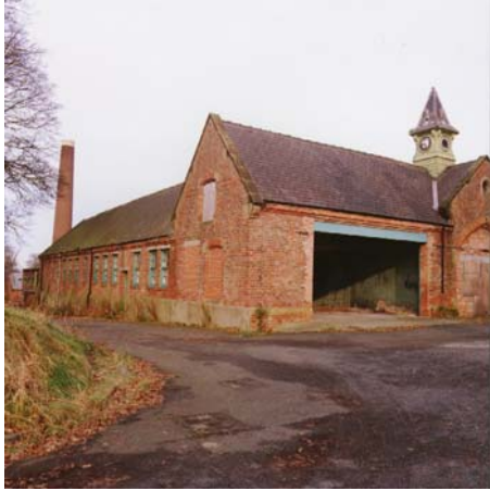
The turret clock in its original home Grey Towers, Nunthorpe. Middlesbrough