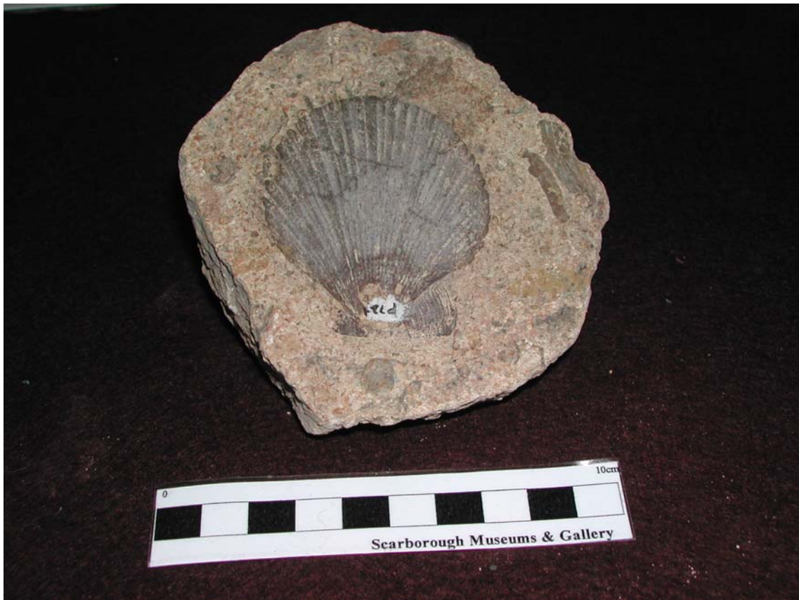
Fossil Chlamys blyensis from the Upper Jurassic Corallian group of North Yorkshire

ID 3119 Scarborough Museums and Gallery Service Conservation of Type and Figured specimens of the geology (palaeontology) collection £7,500