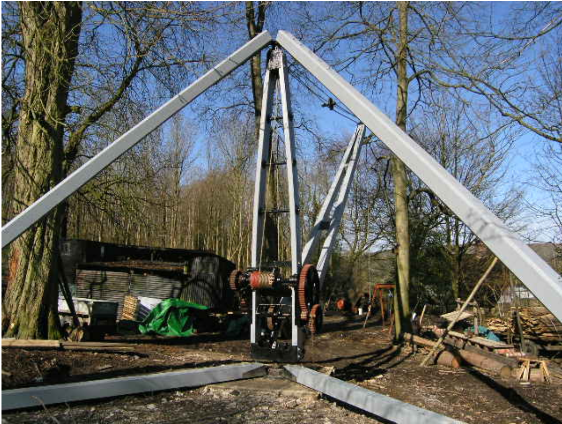
Timber sawmill crane